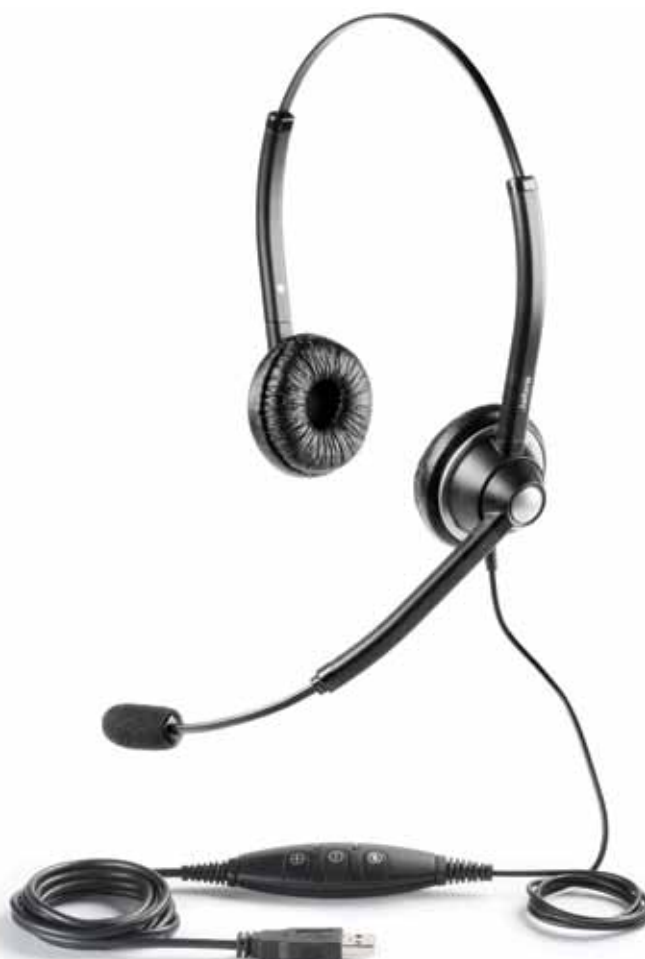
Jabra BIZ 1900 USB

The Jabra BIZ 1900 Series is also available in a QD (Quick Disconnect) variant.