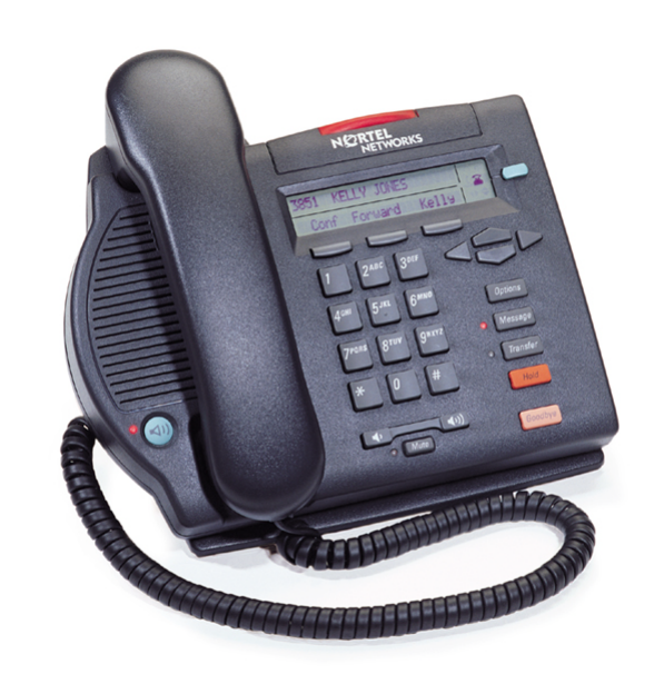
M3902 Quick Reference Card