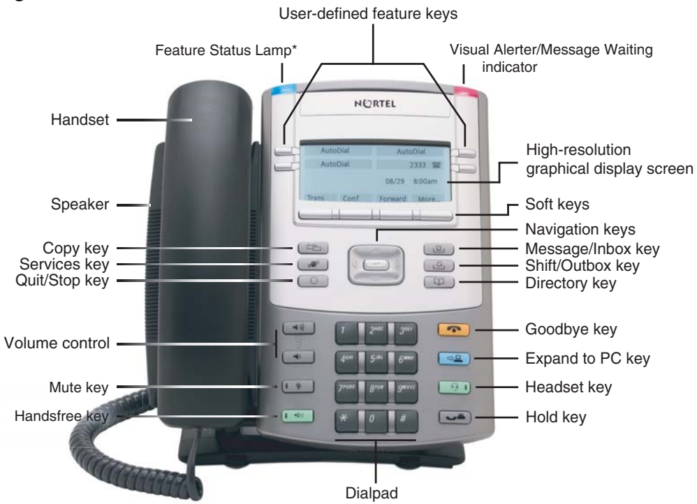
Figure 1 IP Phone 1140E