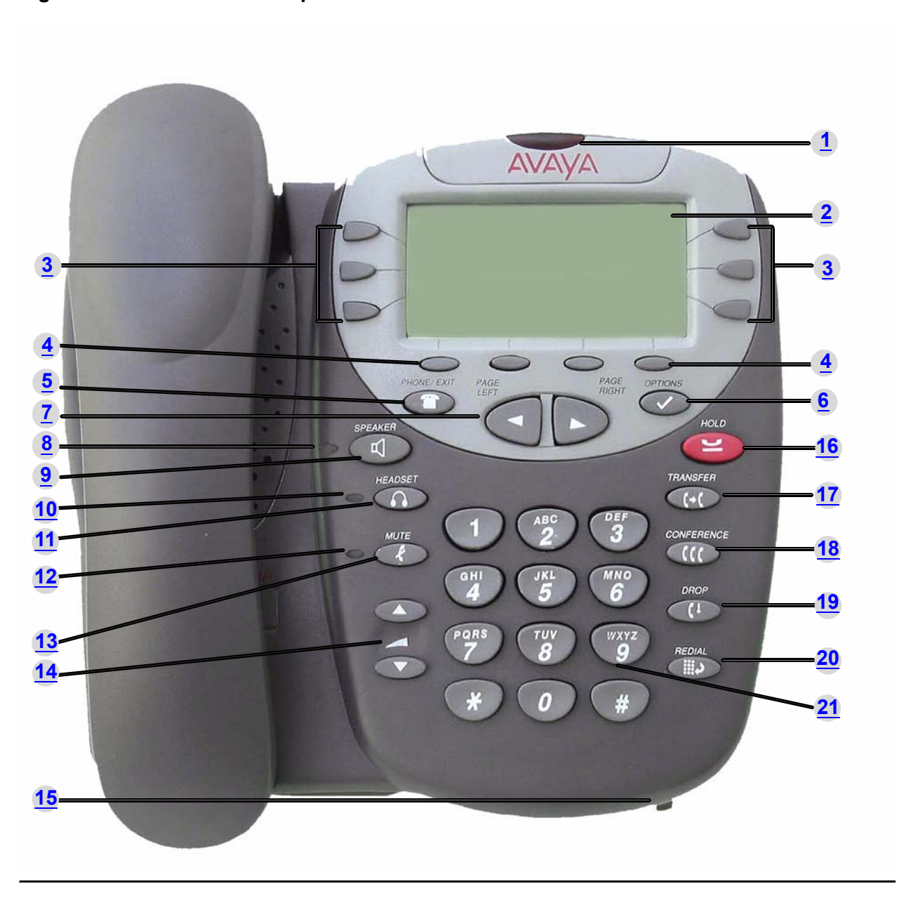
Figure 1: 4610SW SIP IP Telephone